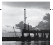
Mr. Charlie